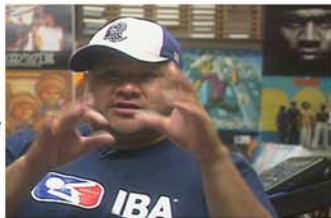
Click 88, Beat-Boxer

This beautifully shot documentary is smooth and cohesive. It is sleek and it is as educational as it is entertaining.